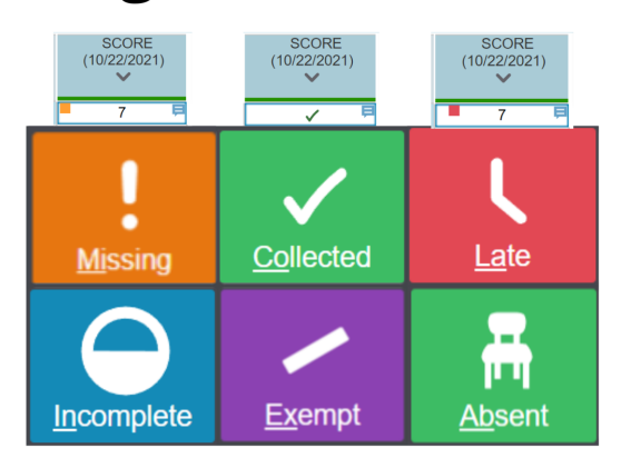
Flags: Use along with or in lieu of an assignment grade. It gives the parent/student extra information to explain grading